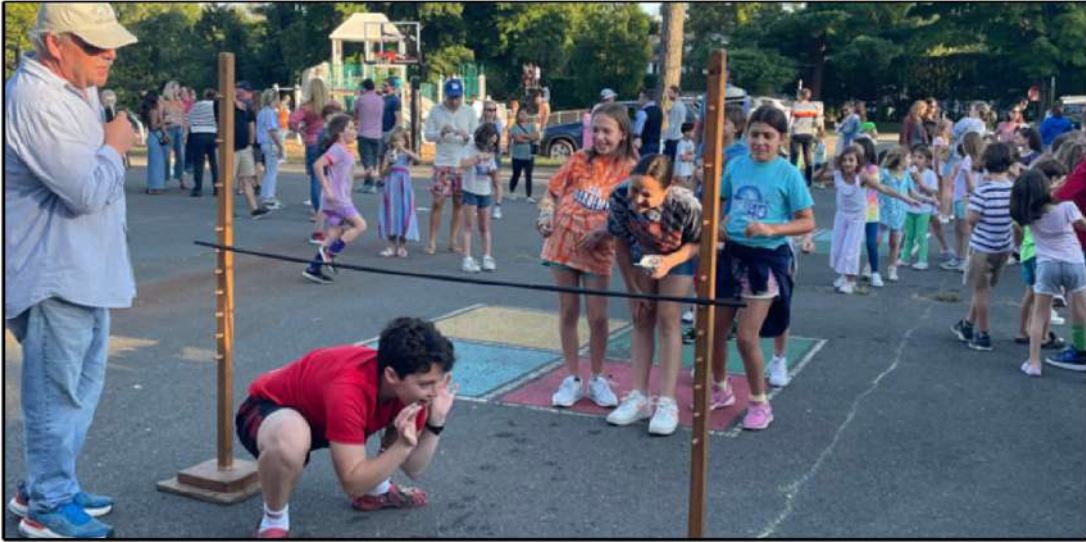
Welcome Back All School Meeting